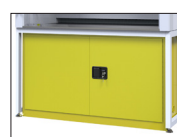
Cabinet (Fire safety type)