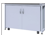
Cabinet (General type)