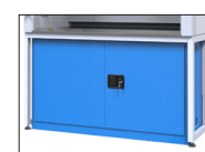
Cabinet (Acid&Corrosive safety type)